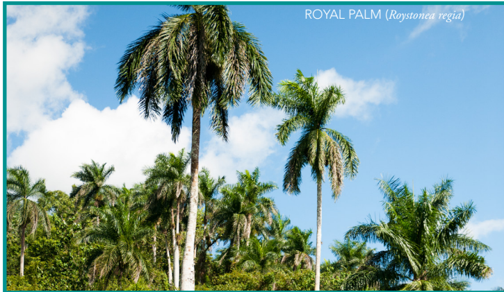
ROYAL PALM ( Roystonea regia )