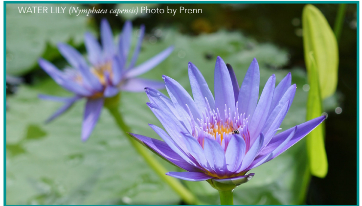
WATER LILY ( Nymphaea capensis )